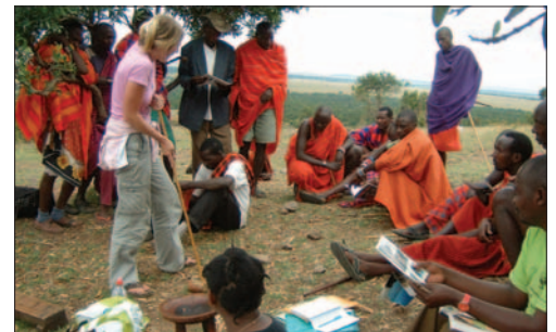
The Masai people assess their returns from tourist excursions using Value Chain Analysis.

By adapting existing diagnostic tools and applying them in new contexts to map revenue streams and policy frameworks, a handful of development practitioners are starting to close this information gap. Using value chain analysis, they aim to map the tourism economy, its revenue streams, and beneficiaries. They can use this to address a range of questions for developing country policy makers seeking to improve the pro-poor impact of tourism.